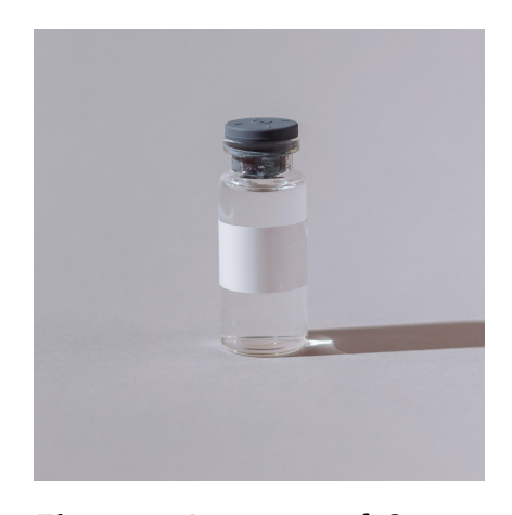
Fig. 1. An image of S-0055 under laboratory conditions.

It can be stored at room temperature and should not be heated to avoid the glass bottle cracking. The lower ends of the thermal spectrum have not be tested, so it is not advised to store "The Forever Serum" in these conditions.