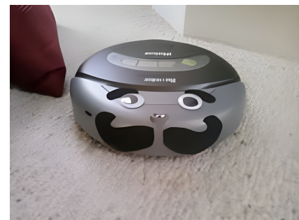
Fig. 1. First known image of S-0139, posted on the /b/ board of 4chan. AI upscaled. The image came with the text: "gave my Friend a savvy old moustache, hes a good ol champ"

S-0139 should be kept in a standard locker, only requiring minimal monitoring due to its nature when not operating. Contact with reflective mirror-like surfaces should be prohibited outside of controlled testing environments. During testing, it should also