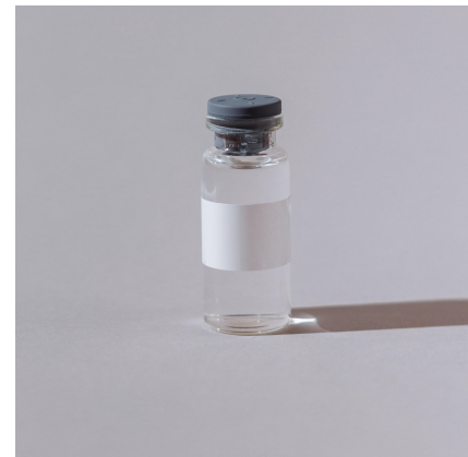
Fig. 1. An image of S-0055 under laboratory conditions.

S-0055 acts similar to a nerve agent, in the way it takes a very small amount of itself to come into contact with human skin for its effects to have consequences. When it is applied to